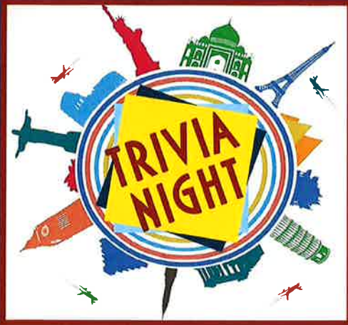
TABLE BOOKING FORM