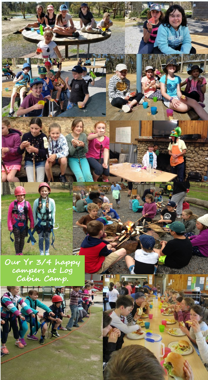
Our Yr 3/4 happy campers at Log Cabin Camp.